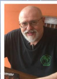
David Weber Author Guest

Science Fiction, Fantasy, Costuming, Gaming, Writing, Art, Film, Science, Cosplay, Horror, Steampunk, Fanfiction, Anime, Literacy, Fanzines, Comics and much more!