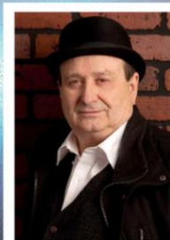
Eric Flint Author Guest