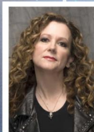
Laurell K. Hamilton Author Guest