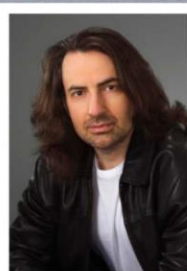
Jim Butcher Author Guest